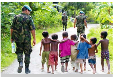
VIOLENCE IN TIMOR: Once a show piece of nation-building, the fledgling nation of Timor-Leste is again a basket case. Pages 13-14

CRISIS IN SUDAN: As the longrunning conflict between north and south seems to be nearing peace, the international community dithers on its response to the tragedy in Darfur. Pages 7-12