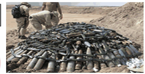
Disposal of Explosive Ordnance in conflict zones is a key activity of EODT.

services through disciplined processes and procedures, incorporating technology and innovation to produce high