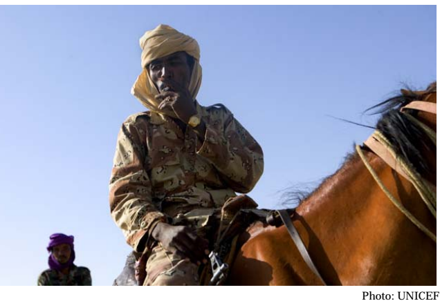
The Sudanese government has demonstrated a severe lack of will in disarming the Janjaweed militia.

By encouraging communities to come back together and begin a reconciliation process, transformational programming goes beyond providing emergency food, water, basic sanitation and