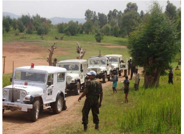
Indian peacekeepers on patrol in the DRC as part of the MONUC mission.