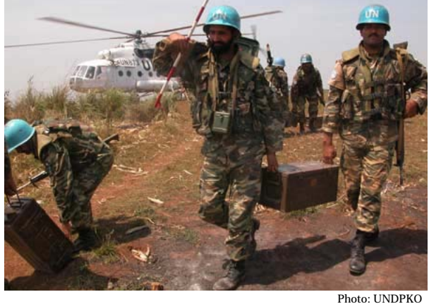
Pakistani peacekeepers deploy to the DRC as part of the MONUC mission.

The European Union has agreed to temporarily supply nearly 2,000 troops to support the UN mission in the DRC (MONUC) as the country prepares for its elections. Limited to only seven months for their deployment and stationed mostly in neighboring Gabon, the few hundred troops actually deployed to the DRC will be restricted to patrolling the airport in Kinshasa and nowhere else. The German contingent,